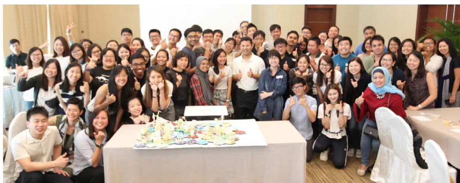
Youth volunteer leaders and partners with Chairman of MND Family Volunteer and Alumni Network, Minister for Social and Family Development & Second Minister for National Development Mr Desmond Lee.