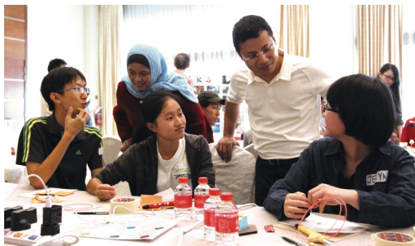
Chairman of MND Family Volunteer and Alumni Network, Minister Desmond Lee, meeting participants