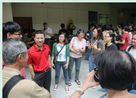
Chairman of MND Family Volunteer and Alumni Network, Minister Desmond Lee, meeting participants

The Singapore Botanic Gardens Learning Forest is open from 5 am to midnight daily. The SPH Walk of Giants and Keppel Discovery Wetlands are closed from 7 am to 7 pm to maintain a conducive habitat for wildlife. Admission is free. Click here for more details.