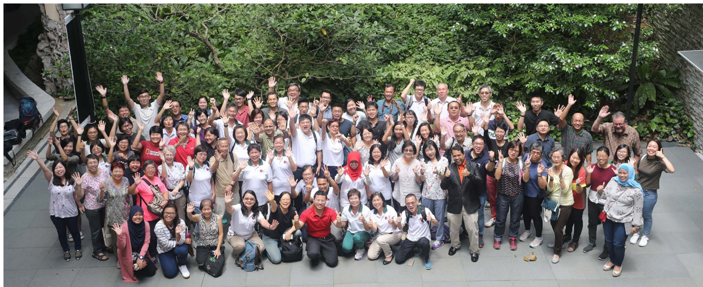
MND Family volunteer leaders with Chairman of MND Family Volunteer and Alumni Network, Minister for Social and Family Development & Second Minister for National Development Mr Desmond Lee, at Singapore Botanic Gardens on 5 May 2018.

Building confidence in public speaking at the 2018 MND Volunteer Leaders Workshop