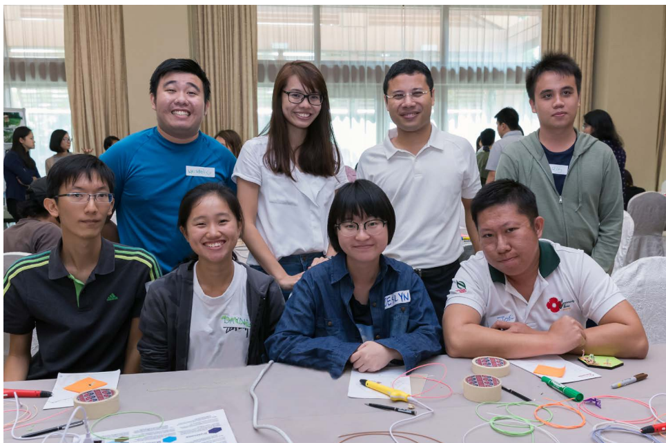
Chairman of MND Family Volunteer and Alumni Network, Minister for Social and Family Development and Second Minister for National Development Desmond Lee (standing, second from right) with youth volunteer leaders and partners at MND Youth Leaders Create on 7 July 2018.