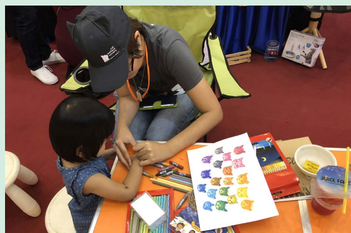
Outreach events are an important way to raise awareness about CWS's work.

In many cases, it is the actions of people, not the cat, that are directly causing the problem. We hope that people will learn to understand this and practise responsible and considerate behaviour instead.