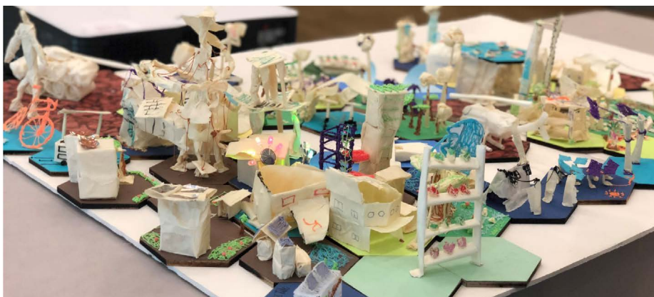
3D model of participants’ ideal city and home, designed to meet diverse needs of a small sovereign city-state like Singapore