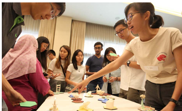
Discussing the allocation of various land uses

Sentosa is synonymous with fun in the sun, so after lunch the teams collected clues and raced across Sentosa to explore some lesser-known aspects of the island.