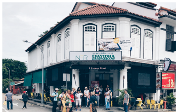
Participants on the guided tours learnt about Kampong Glam's history, communities and trades while discovering its lesser-known stories and spaces.