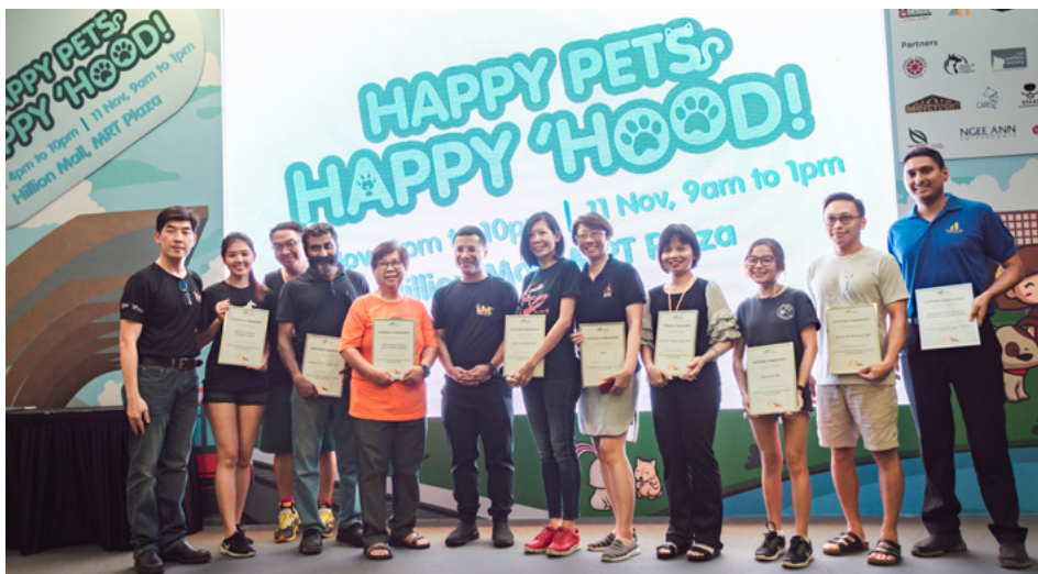
Minister for Social and Family Development and Second Minister for National Development Desmond Lee presented certificates to TNRM partners in appreciation of their strong support and contributions to the successful launch of the programme.

Trap-Neuter-Release-Manage programme launched nationwide as a humane and effective way to manage stray dogs population.