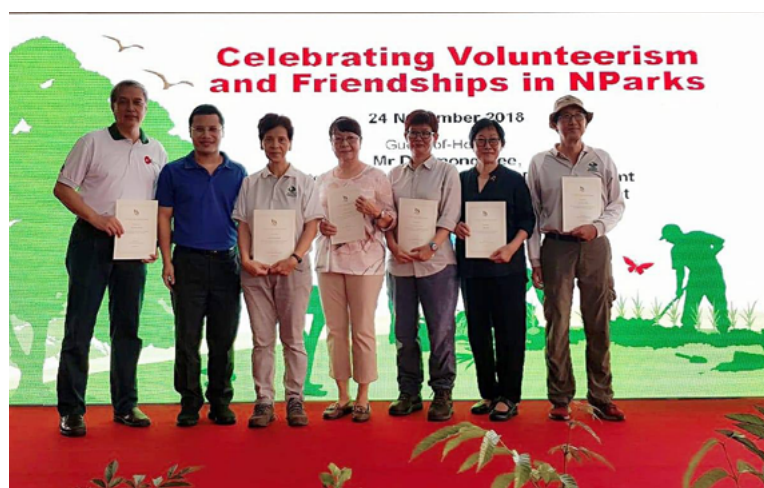
Volunteers received their 10-year and 15-year Long Service awards from Minister Desmond Lee.

A big thank you to all our volunteers and partners for working with us towards our shared vision for Singapore as a biophilic City in a Garden!