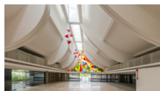
Former Trinity Theological College Chapel

2018 Special Mention: 3 conserved buildings in Sophia Hills Development, namely the former Trinity Theological College Chapel, former Nan Hwa Girls' School and the Olson Building of the former Methodist Girls' School.