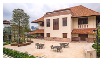
Olson Building of Former Methodist Girls' School