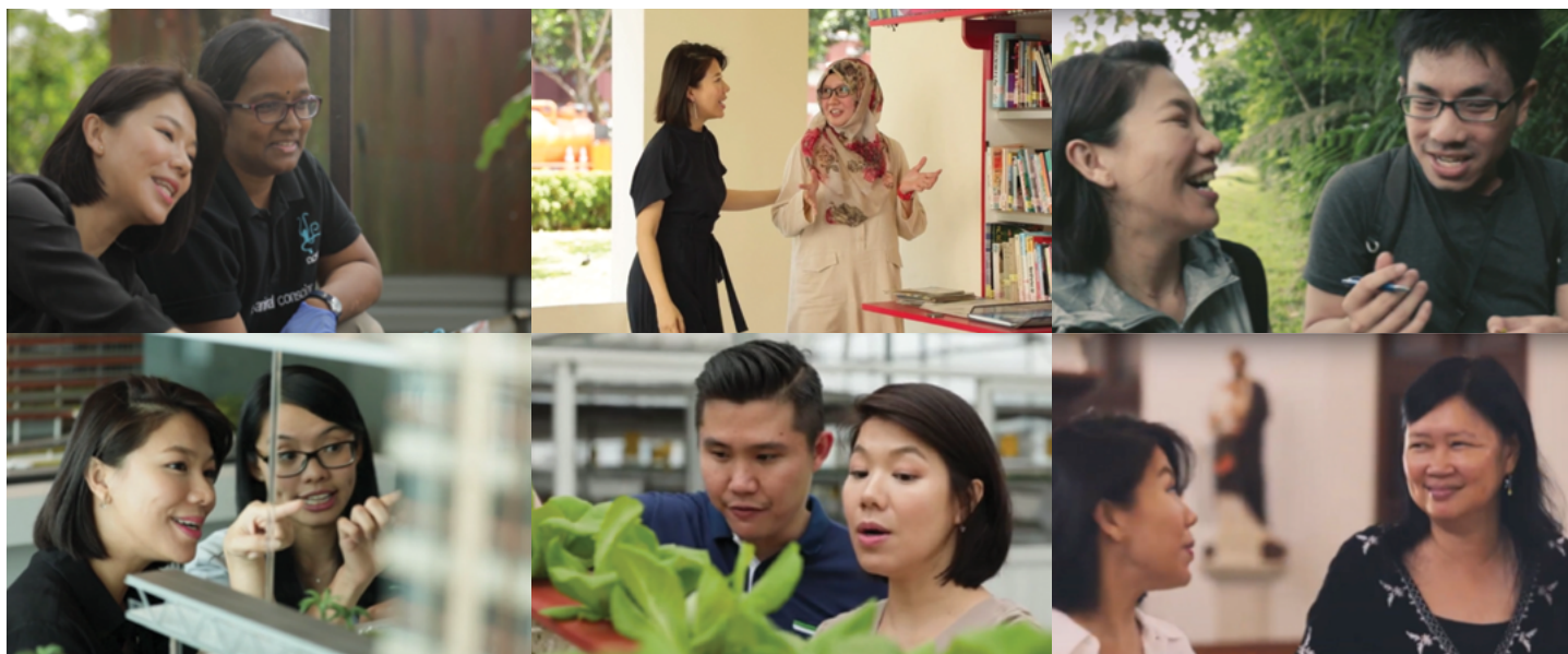
Everyday Heroes: Snapshots of some MND Family volunteers and partners sharing what they do.