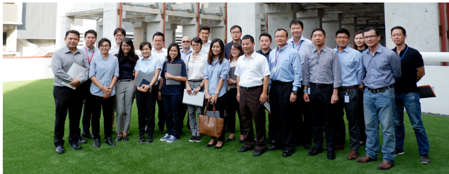
Minister Desmond Lee with Built Environment Young Leaders on a site visit to Straits Construction's Integrated Construction and Prefabrication Hub at Greyform Building in Kaki Bukit in October 2017.