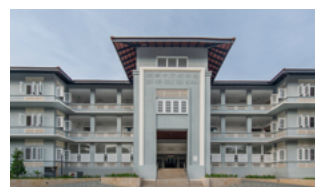
Former Nan Hwa Girls' High School