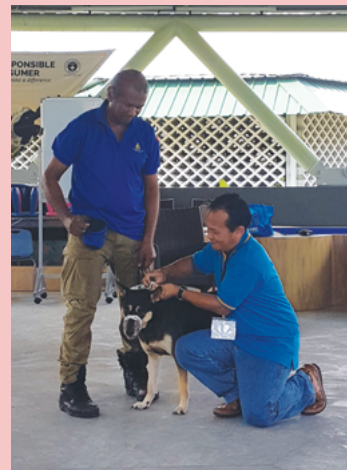
Training by experienced officials from Indonesia on humane capturing and handling techniques for stray dogs (seen here: demonstration on how to muzzle a dog).

conduct training in humane capturing and handling techniques for stray dogs in September 2018. The Indonesian officials have been conducting mass vaccinations of stray dogs in Bali since 2011 as part of a rabies control programme under Indonesia's Ministry of Agriculture.