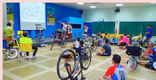
Friends of Park Connector Network conducting a Bike Maintenance Clinic to teach participants how to keep their bicycles in good working condition.