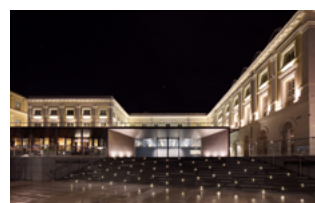
Riverfront Wing, Asian Civilisations Museum