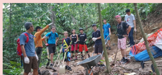
Friends of Bukit Timah Forest and volunteers repairing the Mountain Biking Trail located at the periphery of Bukit Timah Nature Reserve.

Friends of the Parks (FOTP) is a ground-led initiative to promote stewardship and responsible use of our parks. Made up of localised communities that represent the various active stakeholders and volunteers within the park's ecosystem, members play active roles in promoting active and responsible uses of our parks through community-led programmes and initiatives.