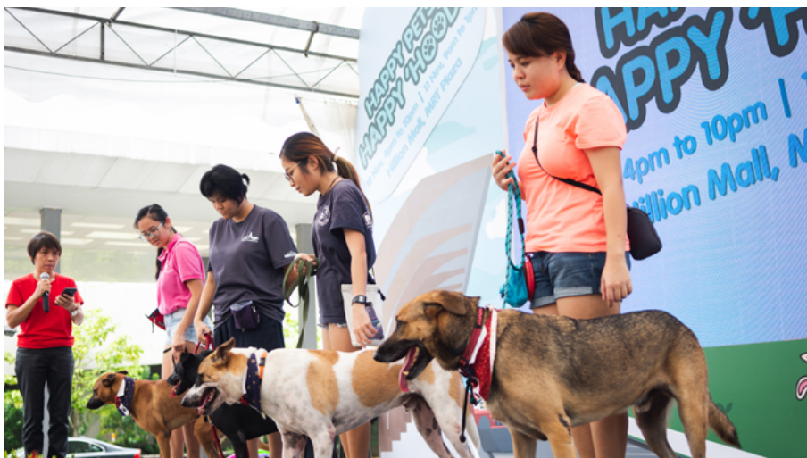
Dog obedience demonstration by Mercylight, one of AVA's rehoming partners.

The event was organised with support from community partners including animal welfare groups, educational institutions, NParks and the Municipal Services Office.