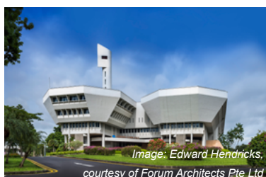
Jurong Town Hall