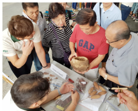
(Left) Volunteers getting up close with various specimens of tree seeds at a booth by Friends of TreesSG, a community group that promotes and shares a love for trees in Singapore. (Right) A young guest participating in a quiz on safe riding by Friends of Park Connector Network.