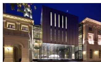
Kwek Hong Png Wing, Asian Civilisations Museum

A new category of award, the 2018 Award for New Design in Heritage Contexts , was introduced to recognise new projects with outstanding design that complement and enrich appreciation of their heritage setting. The Kwek Hong Png Wing and Riverfront Wing of the Asian Civilisations Museum is the inaugural winner of this award.