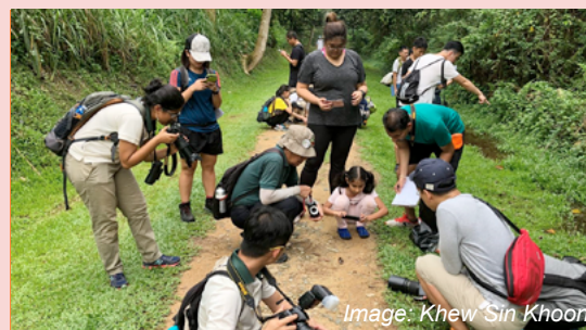
Friends of Rail Corridor taking part in a Nationwide BioBlitz session as part of Biodiversity Week. Biodiversity survey results are crucial in facilitating habitat enhancement works and conservation efforts for Singapore's biodiversity.

Find out more about how you can volunteer with NParks here: www.nparks.gov.sg/contribute/volunteer