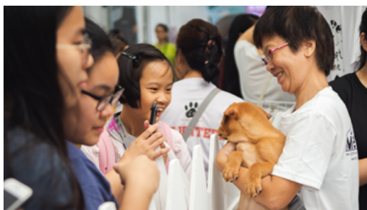
Adoption drive for animals looking for their forever homes.