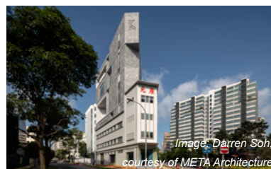
Khong Guan building