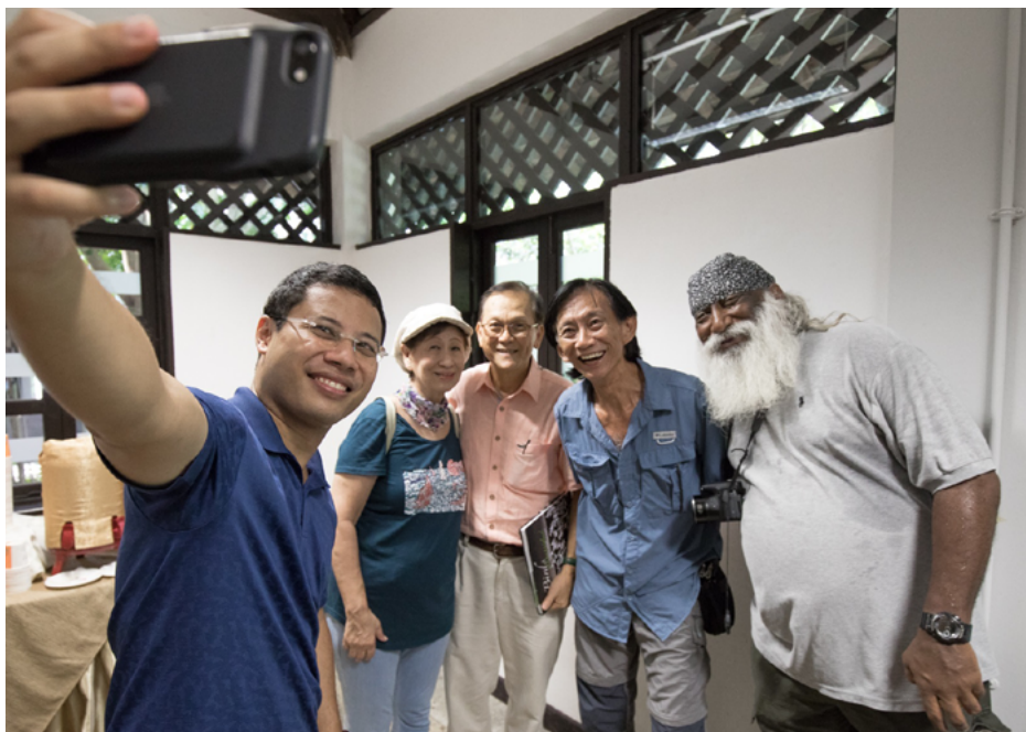
Chairman of the MND Family Volunteer and Alumni Network, Minister for Social and Family Development and Second Minister for National Development Desmond Lee (leftmost) taking a “wefie” with pioneers and community partners at the 25th anniversary of Sungei Buloh Wetland Reserve.