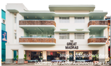
The Great Madras