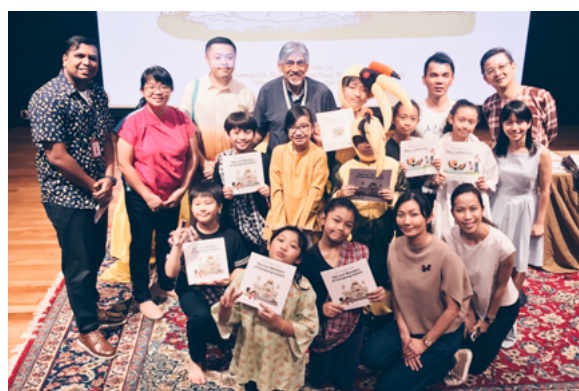
Students from Teck Whye Primary School collaborated with URA to produce two children's storybooks on the adventures of Billie the Hornbill, URA's conservation mascot, in Kampong Glam.