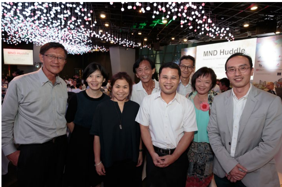
Chairman of MND Family Volunteer and Alumni Network, Minister for Social and Family Development and Second Minister for National Development Desmond Lee (centre), with MND Huddle guests at the annual appreciation event for volunteers and partners at Gardens By the Bay on 17 November 2017.