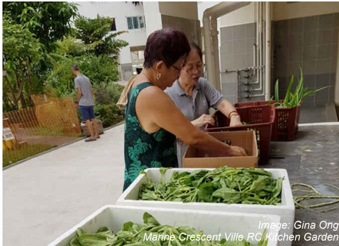
Marine Crescent Ville RC Kitchen Garden