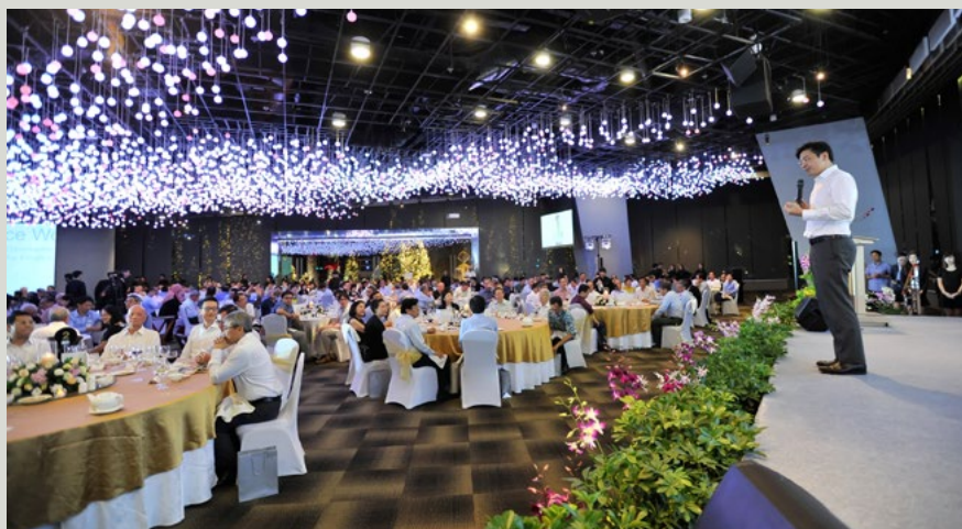
A warm welcome by Minister for National Development and Second Minister for Finance Lawrence Wong at MND Huddle 2017.