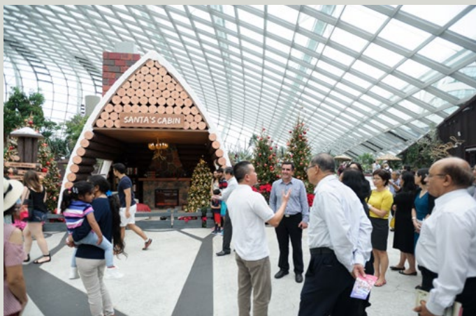
Guests enjoyed a guided tour of the spectacular “Poinsettia Wishes” Christmas display in the Flower Dome conservatory at Gardens by the Bay.