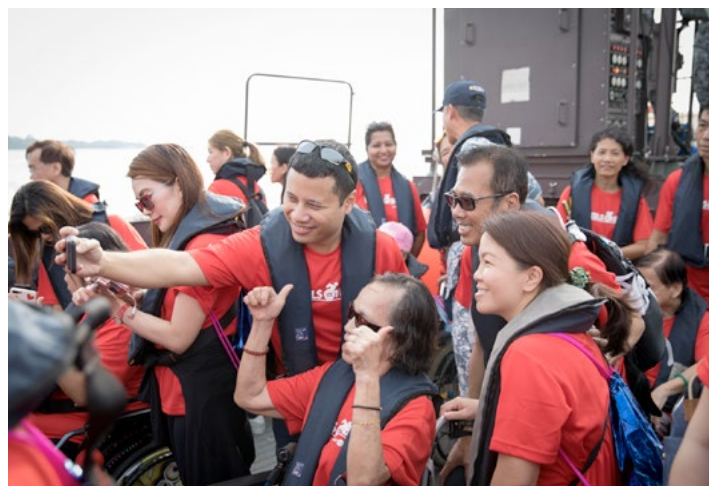
Minister for Social and Family Development and Second Minister for National Development Desmond Lee taking a selfie with participants aboard a Fast Craft Utility vessel to Pulau Ubin as part of ground-up community initiative Wheels@Ubin.

On 2 March 2018, 120 beneficiaries got the chance to enjoy the rustic charm of Pulau Ubin through the ground-up community initiative “Wheels@Ubin”. Beneficiaries included wheelchair users and individuals with disabilities such as muscular dystrophy and cerebral palsy. For many participants, it was their maiden trip to the island. This is the second edition of Wheels@Ubin, which was first held in 2015. This year’s event also included a visit to the Republic of Singapore Navy (RSN) Museum at the Changi Naval Base. Volunteers included personnel from the RSN, SMRT Taxis and DBS Bank; students from Republic Polytechnic and Ngee Ann Polytechnic; and medical personnel. The event was also supported by NParks.