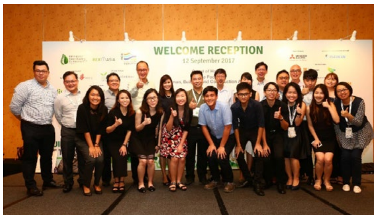
Industry and IHL partners' appreciation session at the International Green Building Conference 2017.