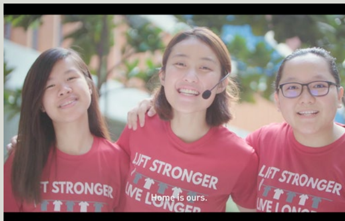
Watch the MND Huddle 2017 video featuring volunteers and partners here .

winter wonderland showcase brought a wistful touch of magic to the evening.