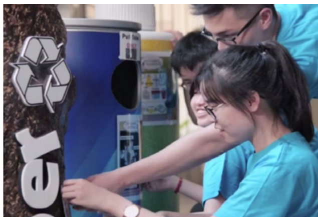
Putting up recycling posters to enhance waste management practices of the school.