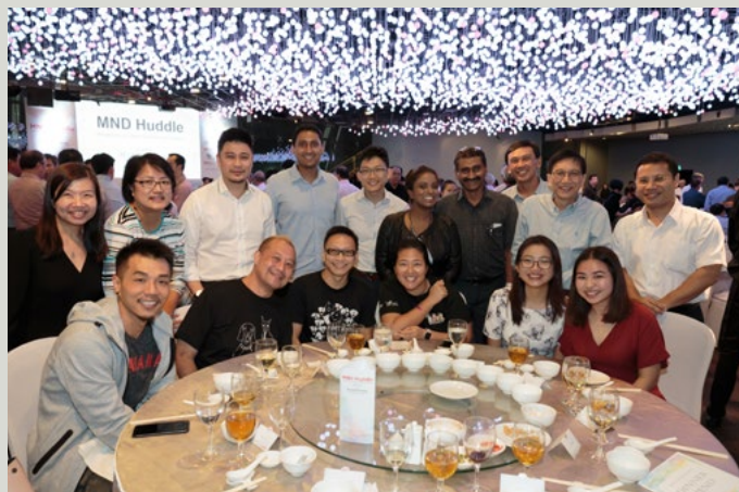
Minister for Social and Family Development and Second Minister for National Development Desmond Lee (rightmost, standing) with MND Huddle guests.