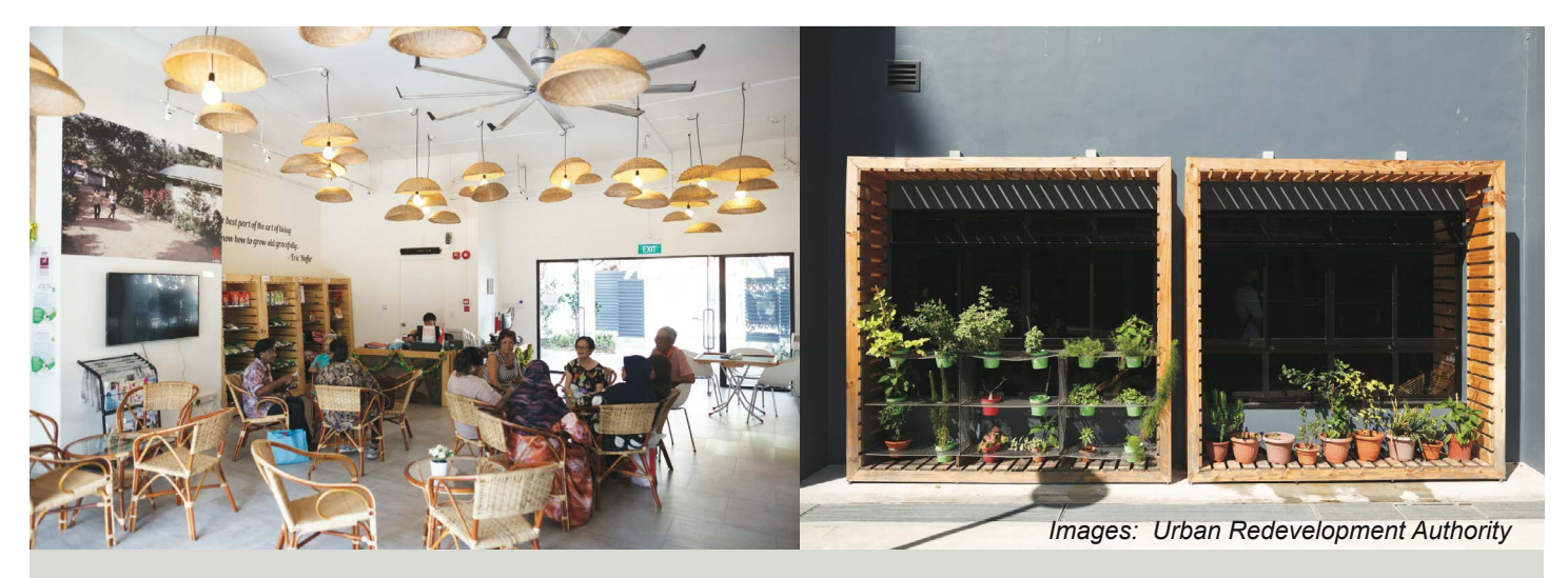
NTUC Health's SilverCOVE Senior Wellness Centre was designed by COLOURS together with Marsiling Rise seniors, who came up with designs and solutions for what they would like to have in the senior activity centre.