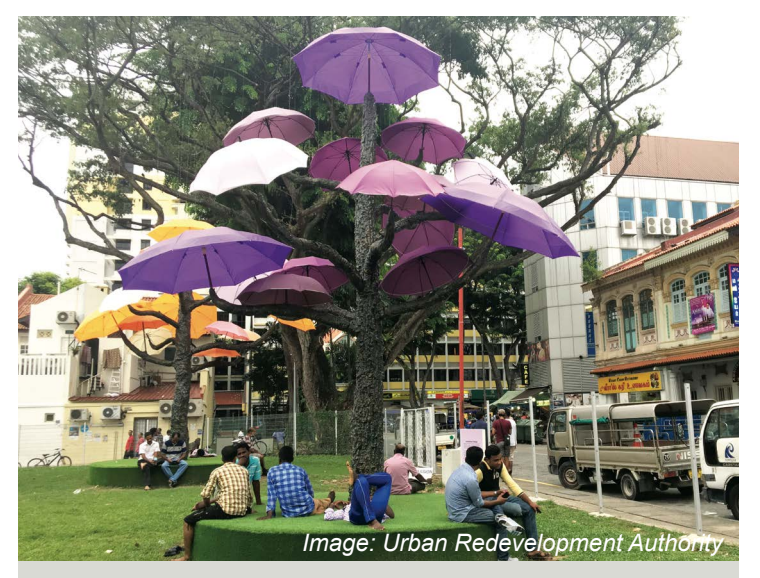
An idea submitted in a previous edition of the competition, the colourful "umbrella trees" at Hindoo Road in Little India provide shade and inject life into a previously unused public space.

Visit <u>www.ourfaveplace.sg</u> for more details. Submissions close on 12 April 2017.