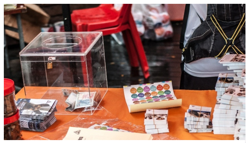
The SOSD flay day raised more than $130,000

On 10 November 2013, Save Our Street Dogs (SOSD) organised a flag day to raise funds to build a larger sanctuary, housing up to 200 dogs, to finance its operating expenses and a nationwide sterilisation project that SOSD initiated, as well as to create awareness for the organisation and its causes. The full-day activity-filled roadshow was held at *Scape, and included a mini-adoptive drive, sale of pet merchandise, photo-taking sessions with the dogs, islandwide fund raising drive and several awareness talks.