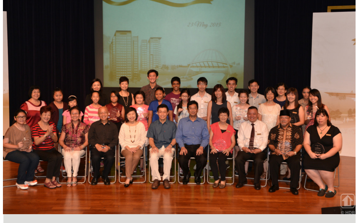
The Good Neighbour Award 2015 national recipients proved that neighbourliness is very much alive in our community.

Image and text courtesy of Housing & Development Board