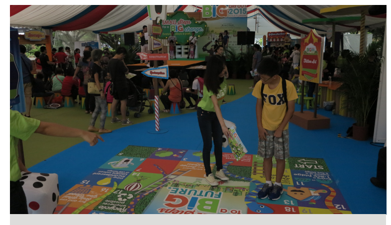
Visitors learnt about green living through fun and interactive games at BiG Day Out 2015.

Visit the BiG Club website to find out how you can take part in the BiG movement too!