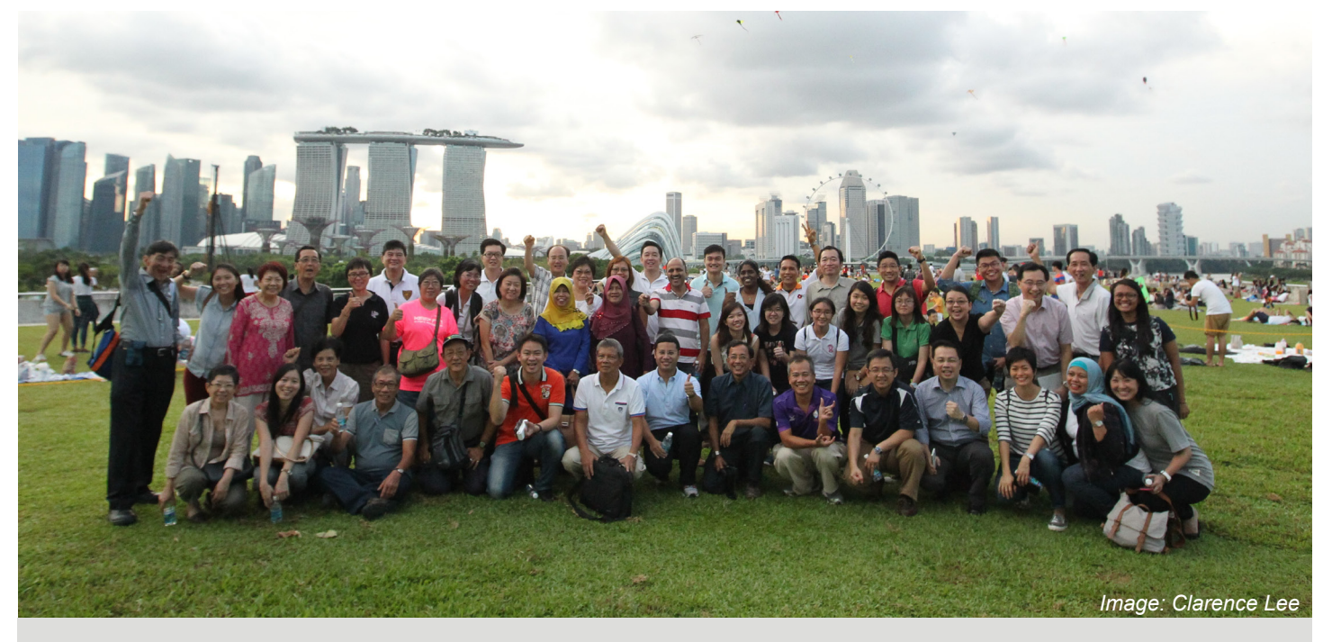
Volunteer leaders from programmes across the MND Family came together for a day of learning and discovery

Fun and discovery at the MND Family volunteer leaders workshop and learning journey