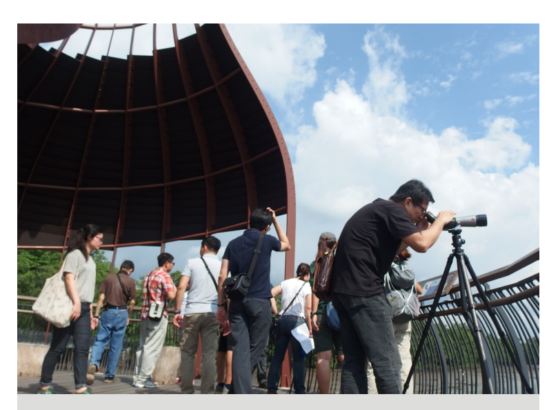
Hands-on training for Heron Watch participants at Sungei Buloh Wetland Reserve extension.

If you enjoy butterfly watching and would like to find out more about butterflies, join in the inaugural NParks Butterfly Count! For one morning in September 2015, volunteers will carry out a butterfly survey at designated sites within our parks. Anyone aged 12 and above is welcome and training will be provided. Visit the NParks Butterfly Count registration site to sign up by 19 August 2015.