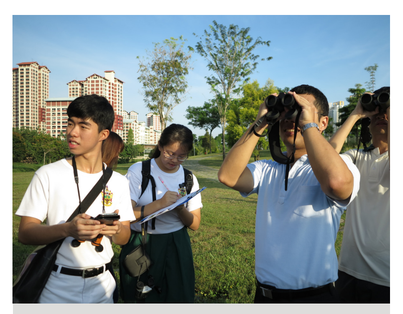
MOS Desmond Lee with participants at the launch of the NParks Garden Bird Count on 16 April 2015.