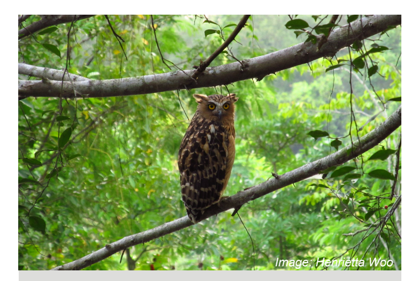
An unexpected sighting during the NParks Garden Bird Count was the rare Buffy Fish Owl at Jurong Lake Park.

The NParks Garden Bird Count will take place twice a year. The next session is planned for November 2015. Data collected from these counts will help in establishing population trends in the long run.