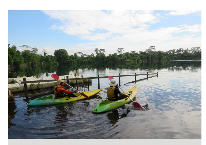
The kayaking activities proved to be popular among Ubin Day 2015 participants.